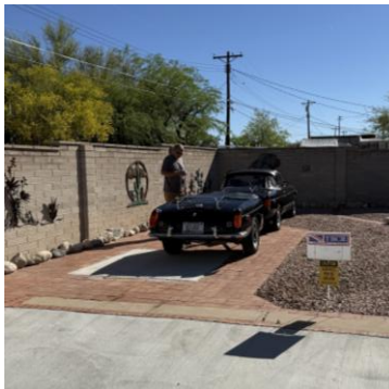
At the start