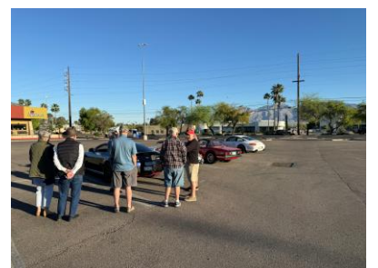
Waiting for the crowd