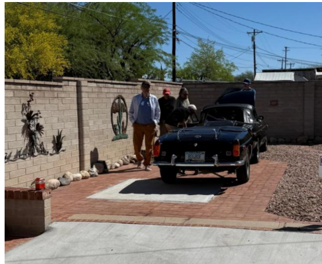
TBCR Team swings into action to get the ol' buggy running smoothly.