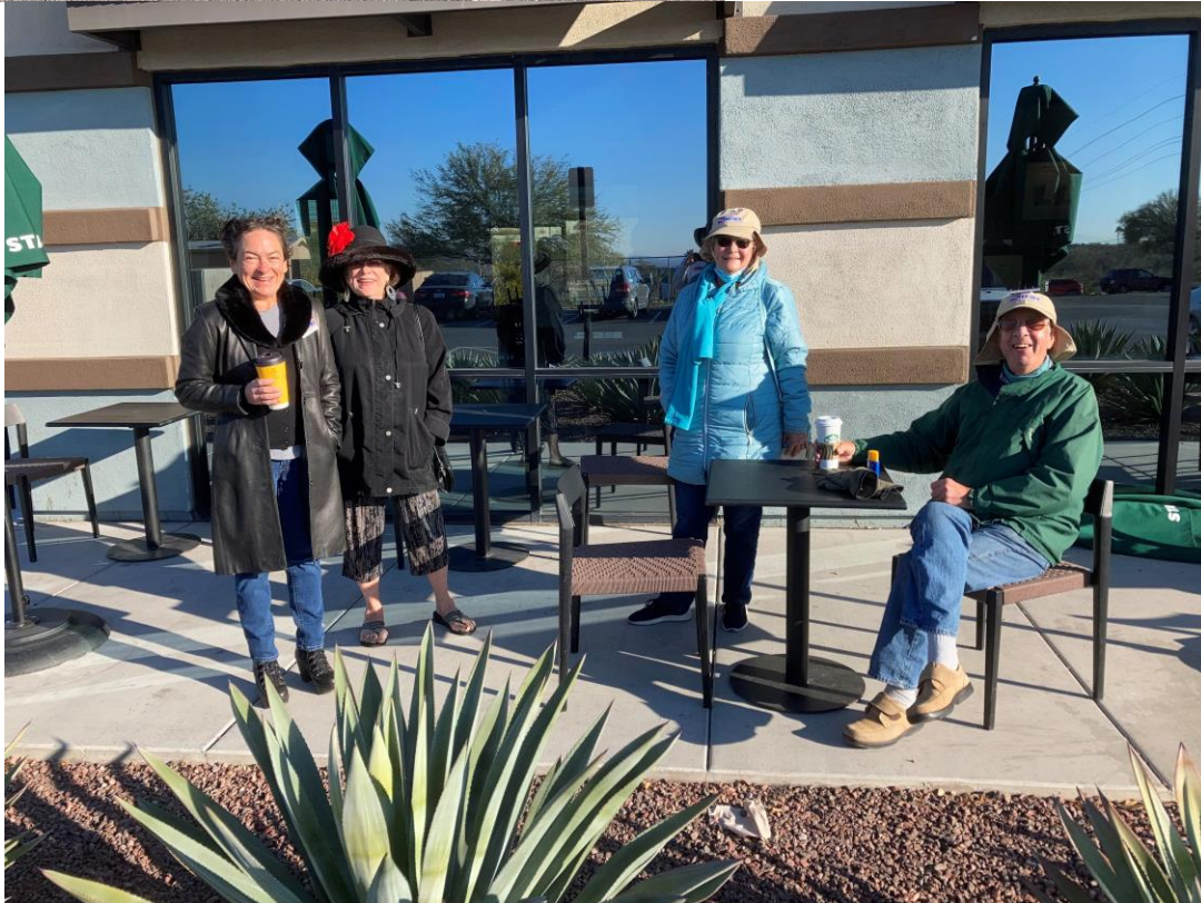
Don't let the coats fool you, it was lovely out there.