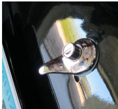
The deck lid lock looking so innocent. Will it work or not?

In pondering the situation, it occurred to me to install an emergency remote latch release cable to the assembly.