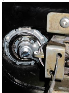
The bottom of the latch assembly (top of picture) The 2 holes in the latch assembly were already in the stamping. Notice the cable and its routing through the hole which is drilled into the lever assembly. The right of the picture shows the clamp. The cable pulls the latch down.