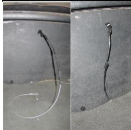
Through the grommet in the trunk bulk head.