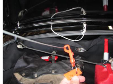
The cable is routed forward. Note the orange clip is fastened to the wire. Add a piece of rope (white) to guide the cable up and hold it out of the way.