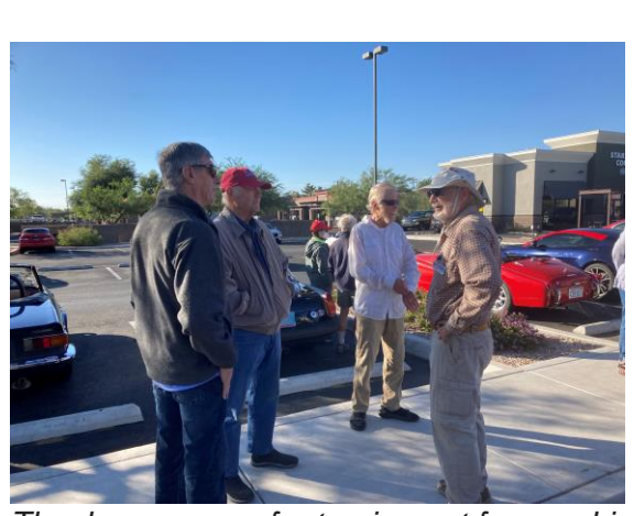
Thanks everyone for turning out for our drives in 2021.