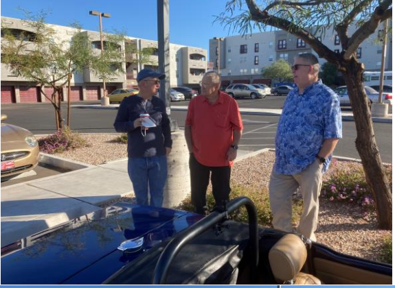
Watch for our December drives!