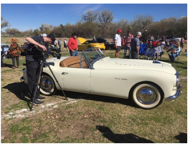
And more on the next page.