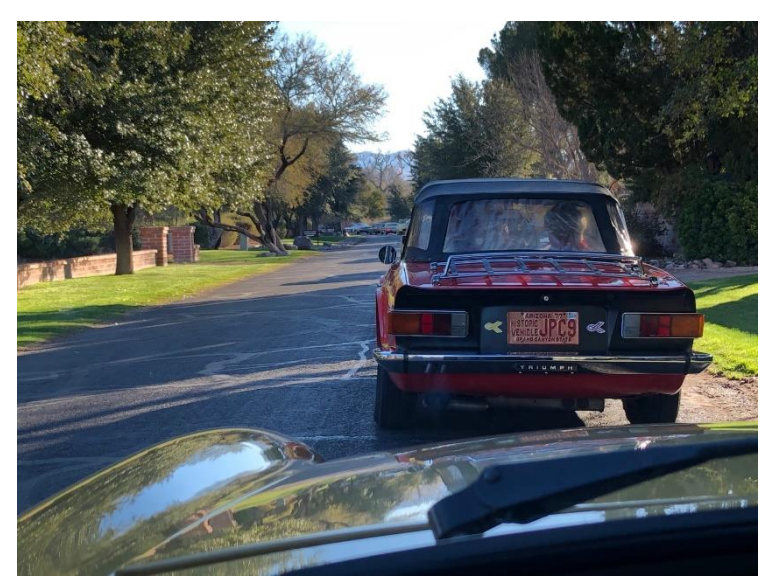
Into the Tubac resort