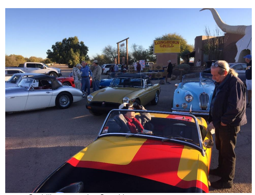
Saddling up at the Cow Horns

The good turnout for the annual Santa Cruise Valley Car Nuts show. Some members met in Tucson, others joined on the way at Amado. The sound of the group accelerating away from the Cow Horns was awesome!