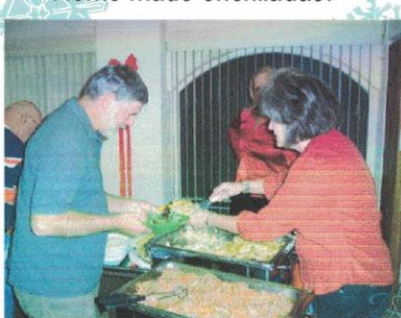
Home made enchiladas!